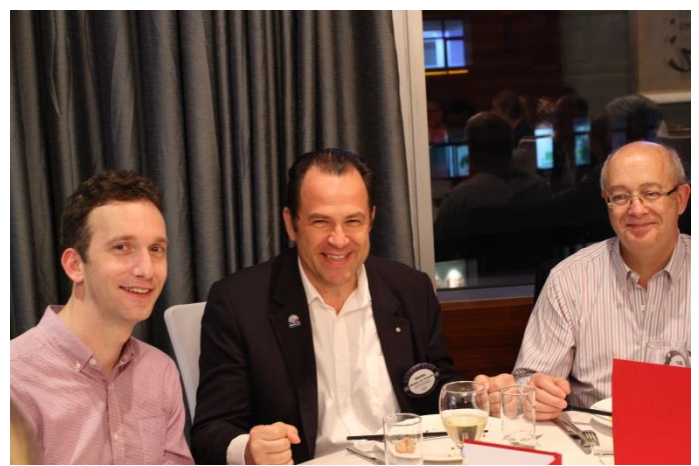
Lovely members, visiting Rotarians and guests enjoying the evening